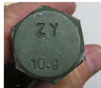
Bolt head with “ZY” code

R 1 3 W R - R E C A L L C A M P A I G N -